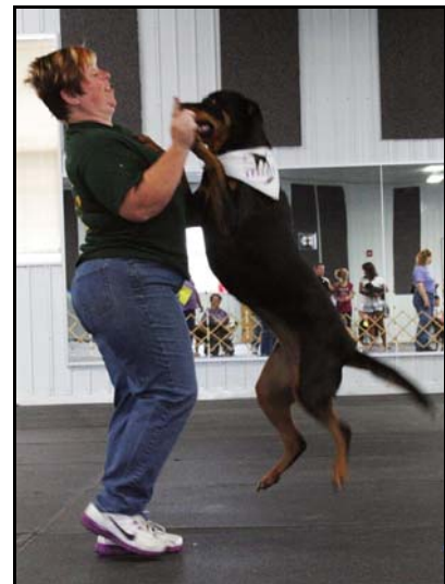
Mikayla and her freestyle instructor at a Responsible Dog owner days freestyle demo.